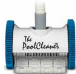
2-Wheel Suction Drive PoolCleaner Part Number: 896584000-013