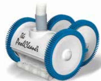
4-Wheel Suction Drive PoolCleaner Part Number: 896584000-020